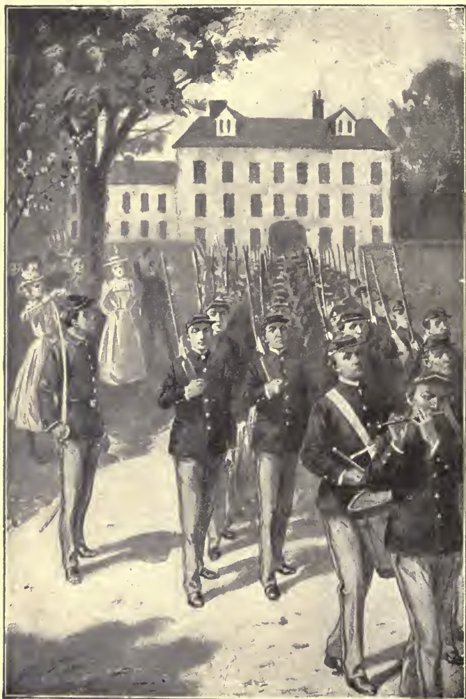
"OFF FOR THE SUMMER ENCAMPMENT."